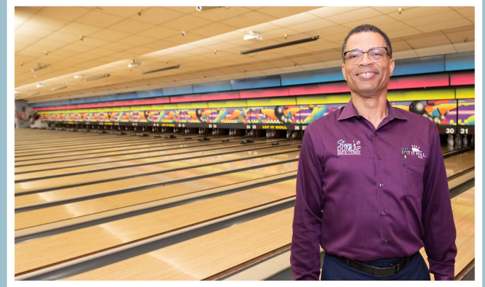
Location: Phoenix, AZ